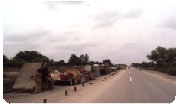
People living on road sides in miserable condition, Rajan Pur