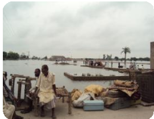
Jampur Tehsil Villages have been washed away by the flood (Picture taken on August 8, 2010)