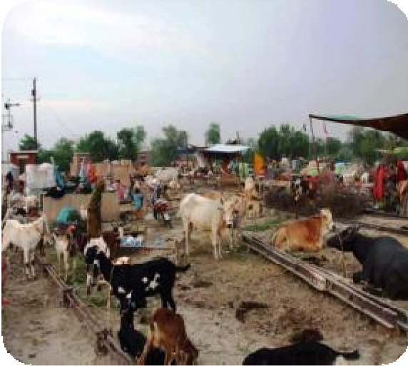
Railway Station Kot Mithan, Rajanpur