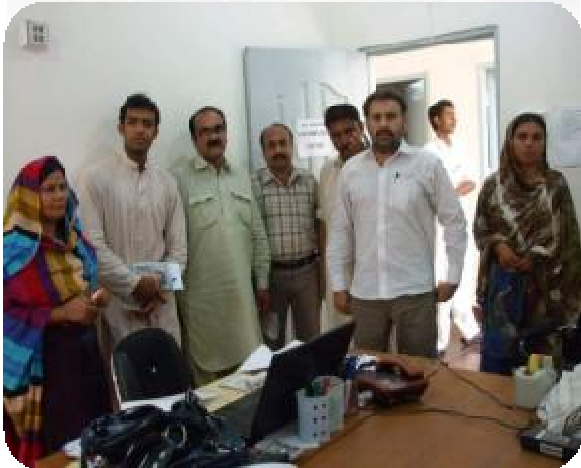
Meeting with HELP Foundation Mithan Kot, EDO F&P, President Press Club and LPP staff is also with the team