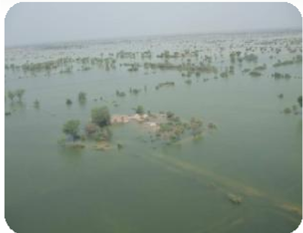
Entire "Sohnwa" area of district Rajanpur drowned in Flood