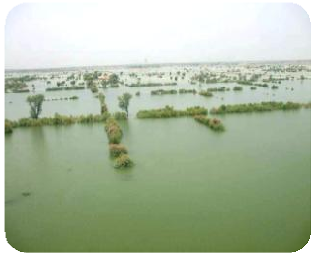
Arial View of Pul Pathan, Rajanpur