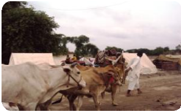
Jampur city huge influx of IDPs